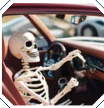
Skeleton pulled over for DUI!