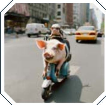
Pigs on a joyride