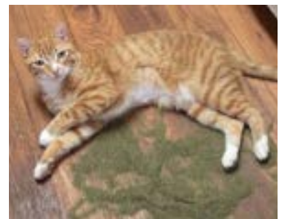
Dangerous amount of Gato Ganga