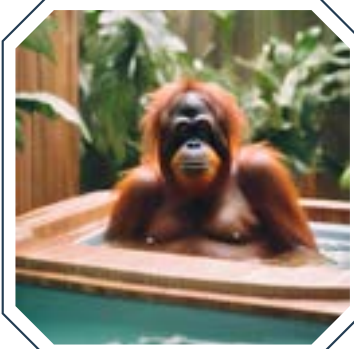
Orangutan in hot tub