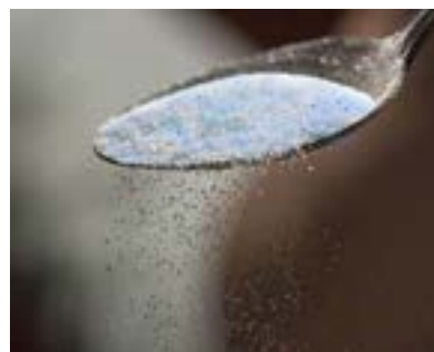
Enough Fun dip® to kill a Carebara atoma ant